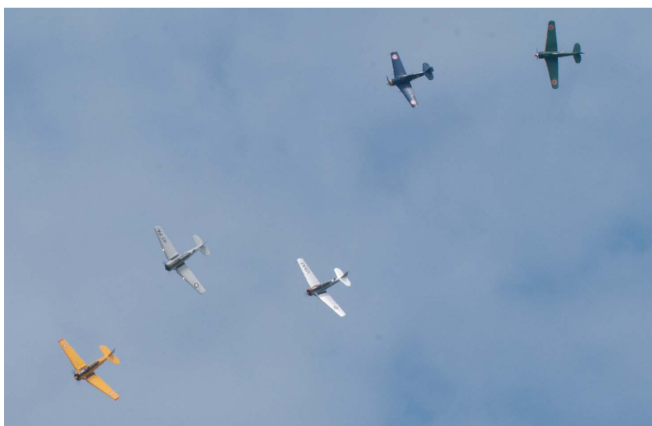
NEW MEMBERS JOIN THE FW DURING THE FERTÉ-ALAIS AIRSHOW