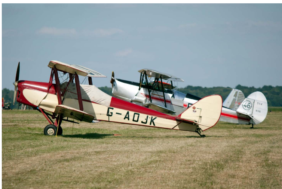
COMPIÈGNE AÉRO CLASSIC 2015